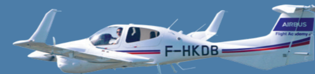
3 - Diamond DA42

Our latest generation flight simulators allow students a smooth familiarisation in realistic environment on all the technical aspects of the aircraft.