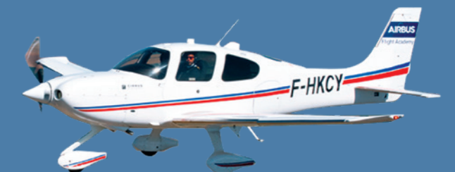
10 - Cirrus SR22