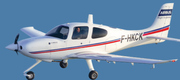
21 - Cirrus SR20