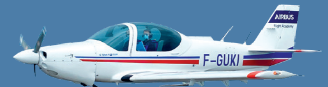
18 - Grob 120 A-F